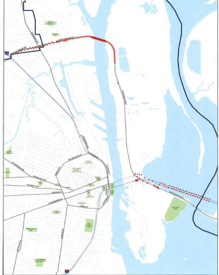
ZONE 4 I-10 STREET LIGHTS (EAST OF RIVER)

City of Mobile Geographic Information Systems Dept. 225 Government Street, 4th Floor Mobile, Alabama 36602 404-681-2222 4/18/2021 Create Date: 4/18/2021