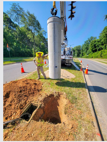
ZONE 1 I-10 STREET LIGHTS (WEST OF RIVER)

• Zone 1 Street Lights ■ City Limits ■ Water ■ Parks ■ Golf Course ■ Airports NOTE: There are approximately 440 +/- Lights in Zone 1.